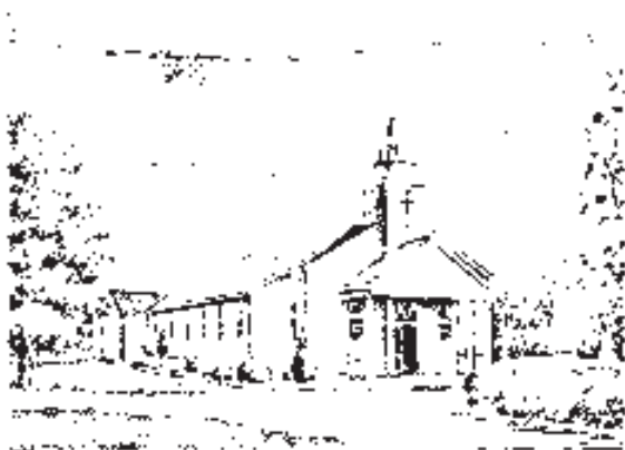
Immaculate Conception 20916 Dalton Road, Box 128, Sutton West, ON L0E 1R0 parish@immaculateconception.on.ca